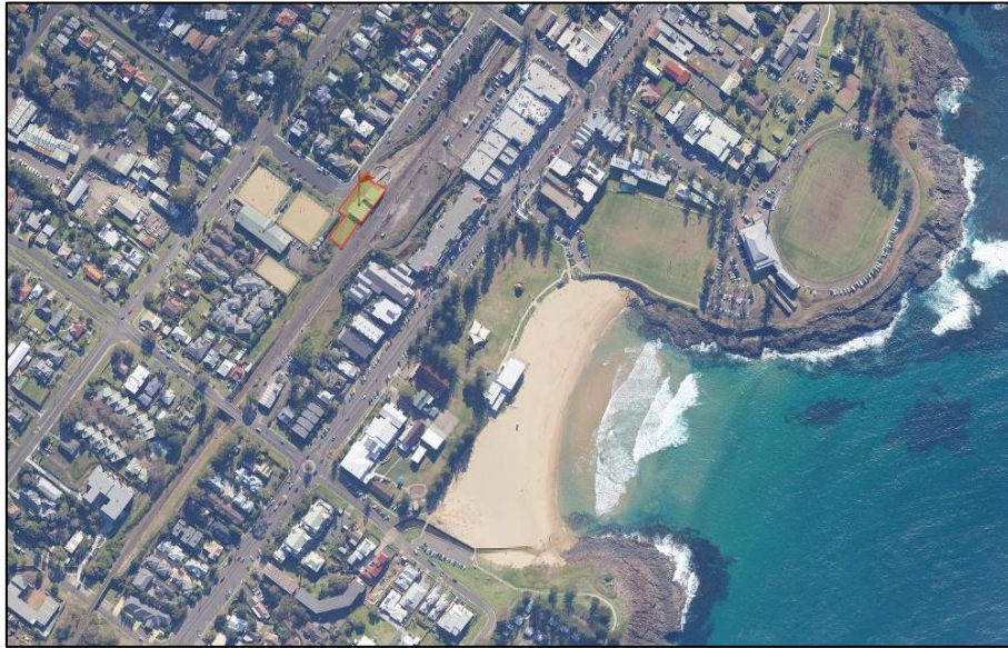
Figure 3 – Aerial Image 20 Eddy Street

amount of ‘red tape’ it is proposed to make community facilities a use that is permitted without development consent on the site. The site is shown in Figures 3 and 4 below: