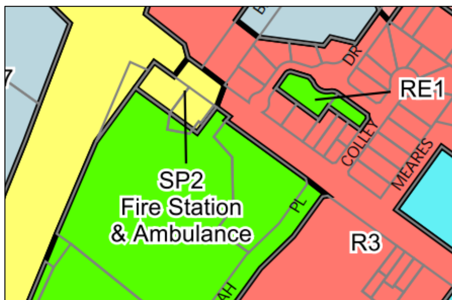
Figure 1 - Current Zoning Annotation of 206 & 210 Terralong Street

The PP seeks to amend land use annotations for certain sites that are not annotated with a land use listed within the infrastructure categories of the Infrastructure SEPP or the Standard Instrument dictionary. An example of this is Figure 1 shown below: